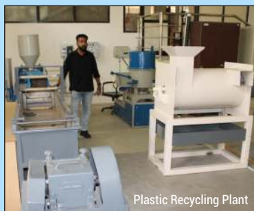
Plastic Recycling Plant